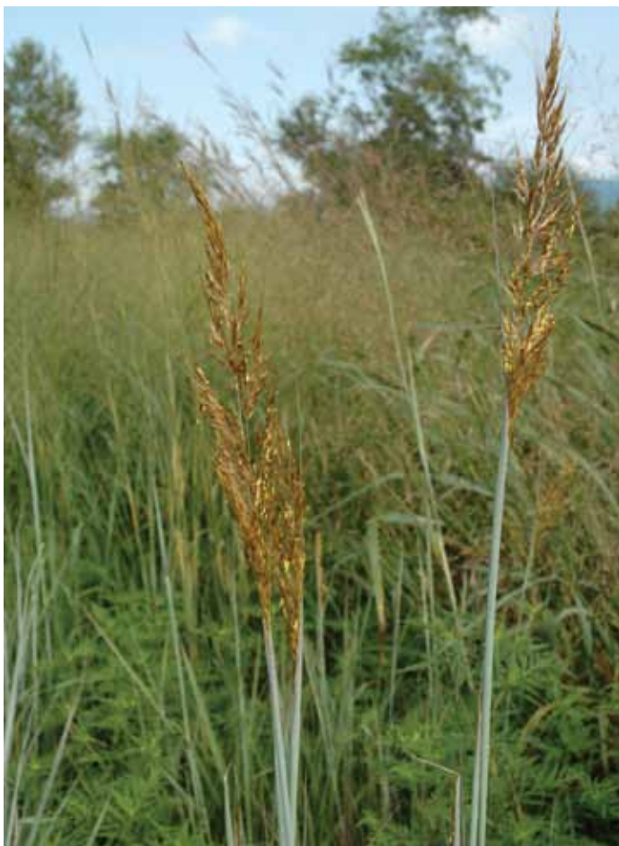
Fig. 7. Indiangrass is easily recognizable by the blueish hue of its stems and the large yellow seedheads. Indiangrass is the latest of the NWSG to produce seedheads; typically they appear in July and August.

Probably the most widely used variety in the Mid-South, Rumsey was developed from plant material from south-central Illinois. It produced yields similar to Cheyenne in variety trials conducted by the University of Kentucky.