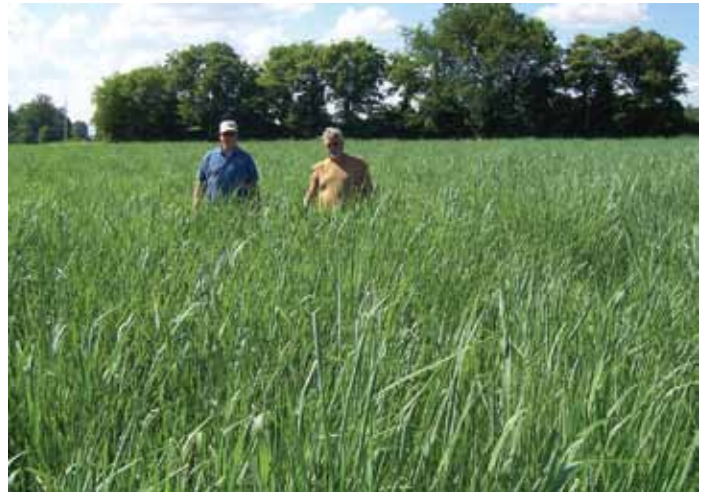
Fig. 4. Switchgrass is a tall, robust grass that produces high yields. Seedheads are open “panicles” typical of the panic grasses and appear during mid- to late-June.

Developed from plant material collected in southern Texas, Alamo is a lowland variety that is currently considered the primary species for biofuel production. At maturity, Alamo commonly reaches heights of 10 feet and can produce substantial amounts of forage. Like