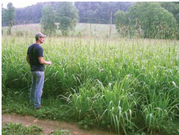
Fig. 8. Eastern gamagrass produces impressive yields of quality forage. Its seedheads appear in June and are quite distinctive.

Like switchgrass, eastern gamagrass produces very high yields and tolerates wet sites (Fig 8). It begins spring growth sooner than the other NWSG and also maintains growth later in the season than the other species – with the exception of indiangrass. It can support high stocking rates due to its high productivity.