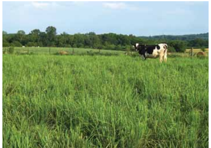
Fig. 9. Native warm-season grasses, such as this mixed stand of big bluestem and indiangrass, provide excellent grazing during the summer and provide a buffer against drought. Bred Holstein heifers (1000 – 1100 lb) gained nearly 1.9 lb per day during 2010, one of the hottest summers on record in Tennessee. Such grasses can provide a strong complement to existing cool-season grass forages.

All of these publications may be accessed online by going to: http://nativegrasses.utk.edu .