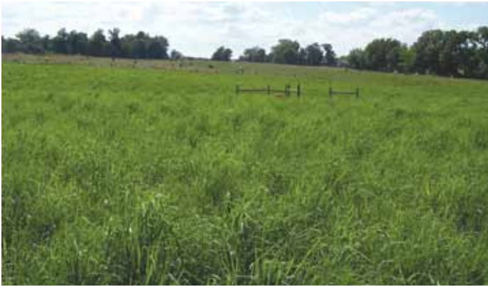
Fig. 5. Big bluestem is a fine-leaved species that produces good yields of excellent forage. Seedheads are produced in June and July and are easily recognized by their “turkey-foot” appearance.

easier to manage. It tends to mature somewhat later than switchgrass. There are many varieties of big bluestem available, but here we consider only two.