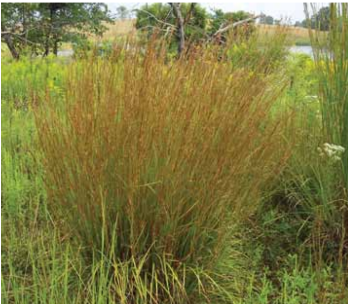
Fig. 6. A mature clump of little bluestem, a smaller bunch grass that often shows a reddish hue on its stems. Note the mature big bluestem plant in the background on the right. Despite its smaller size, little bluestem can produce desirable forages – even on poor ground.

A more recent release, OZ-70 was developed from plant material collected from a number of locations in the Mid-South. As such, it is one of the first varieties of big bluestem from this region. Like other varieties of big bluestem, it has wide site adaptation, but will not tolerate flooding as well as switchgrass.