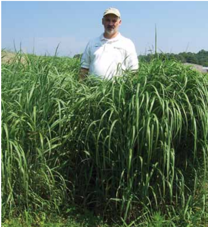
Fig. 2. This 18-year-old stand of cave-in-rock switchgrass continues to produce large volumes of quality forage.

As with any forage, hay quality is strongly influenced by timing of harvest. Harvest of NWSG at late-boot stage will typically produce hay with protein levels of 10 percent or higher. However, like most warm-season forages, NWSG will test at levels below those for cool-season forages harvested at a comparable maturity level. This is partly because proteins in NWSG do not break down as quickly during ruminant digestion and bypass the rumen; thus, they are referred to as “bypass proteins.” Because bypass proteins can be absorbed in the intestines, animal performance on NWSG exceeds what we would predict based on forage sample analysis. For example, when grazed, NWSG routinely produce from 1.5 – 2.5 lb of daily gain in steers (Fig 3). Furthermore, NWSG forage quality is not diminished by endophyte fungi, a substantial problem with tall fescue.