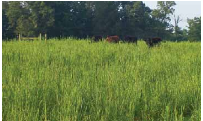
Fig. 3. This 2-year-old stand of big bluestem and indiangrass is providing excellent summer forage with gains of more than 2.2 lb per day on 600 - 800 lb steers.