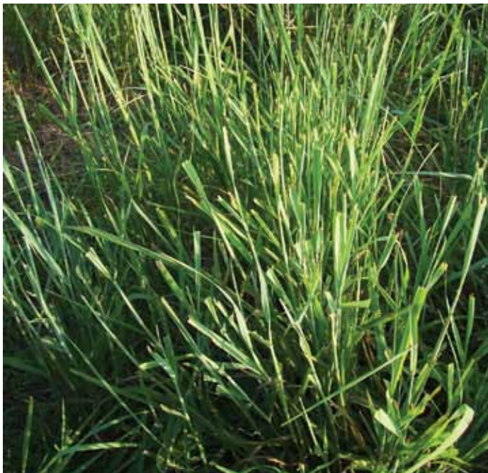
Fig. 8. Without adequate grazing pressure, NWSG, especially switchgrass (above), can become too stemmy and forage quality will decline.

During the first 6 – 8 weeks of the growing season, forage production from these grasses is quite impressive. Often, producers do not stock heavily enough and the forage gets ahead of the cattle, at which point it becomes mature and stemmy (Fig. 8). Allowing the forage to get more than 30 inches tall will make grazing management difficult, particularly during the early portion of the summer, and forage quality will be reduced. When NWSG reach the appropriate height to initiate grazing (see When Do I Start Grazing , on page 6), you may still have ample forage in your cool-season grass pastures. In that case, you will need to make a decision on which forage you should use based on the class of animals (cow-calf, heifers, steers, etc.) you are grazing and their nutritional needs. Be prepared to harvest unused forage on the pasture that you do not graze.