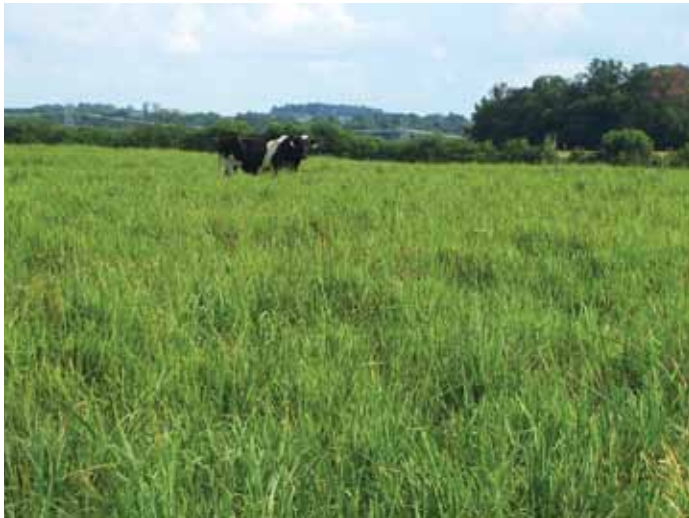
Fig. 10. A properly grazed mixed stand of big bluestem and indiangrass (above) can provide high-quality forage during hot, dry summer months, providing an excellent complement to cool-season forages.

All five species require maintenance of adequate root reserves to keep the plant healthy. A stand can last for 15 – 20 years or longer with proper management. But with persistent over-grazing, stands can be weakened and gradually lost to weed competition. For these reasons, it is very important to maintain stand height above 15 inches and cease grazing once stand height drops below 12 inches. Sustained grazing at heights of less than 15 inches will severely thin a stand in two to three years. The later in the season overgrazing occurs, the more serious the potential impact.