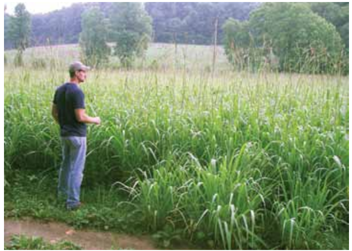
Fig. 6. Eastern gamagrass is a robust grass with an unusual seedhead that is the earliest of the NWSG to come out, typically in late May.

water use and more adapted to hot, dry summer conditions. They complement cool-season forages by providing production during the summer months. By growing both cool- and warm-season forages, your farm can produce an adequate supply of high-quality forage for a much greater portion of the year.