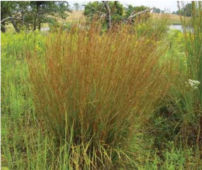
Fig. 4. Little bluestem, as its name implies, is shorter than the other NWSG, but still retains the “bunch” growth habit common to these species.