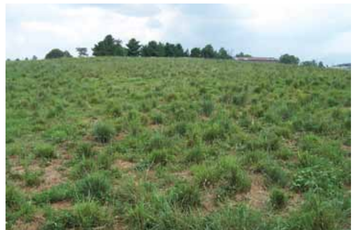
Fig. 7. Grazing below 12 inches weakens NWSG and allows weed encroachment.

Because all of these grasses are tall-growing, they have few leaves close to the ground and growing points much higher above ground than many of the other forage species grown in this region. Consequently, they are more prone to overgrazing and should not be grazed closer than about 12 inches tall. If they are grazed below this height,