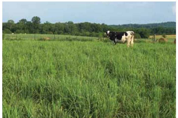
Fig. 9. Maintaining proper grazing pressure will result in grass canopy heights between 15 and 20 inches tall, an ideal situation for maintaining high-quality forage and vigorous NWSG stands.

This approach involves monitoring the height of your pastures once a week or perhaps once every two weeks and adjusting the number of animals as needed to maintain the proper grass height (Fig. 9). When the grass in your pasture drops below 15 – 18 inches in average canopy height, remove some animals to reduce grazing pressure. On the other hand, if it gets above 20 to 24 inches in average canopy height, be prepared to increase stocking rate. If you use this approach, you need to have additional pasture of some type to be able to hold the animals you have pulled off the NWSG. The key is to regularly observe your pastures and know their condition so you can anticipate adjustments. With some experience, you should only have to make minor adjustments. For example, following the guidelines provided below for stocking rates, only two or maybe three adjustments will be needed all summer to manage bluestems or indiangrass. Switchgrass, on the other hand, may require more frequent adjustments, especially early in the season when growth is most rapid. In terms of numbers to adjust, generally you will only need to increase or decrease by about 20 percent at any given time.